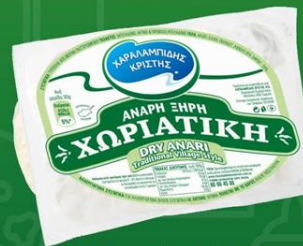
Dry Traditional Anari Sold according to weight in individual packaging