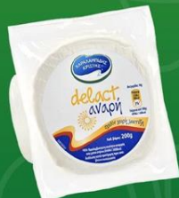
Delact Anari Available size: 200g