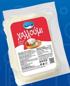
Halloumi Full fat Sold according to weight in individual packaging