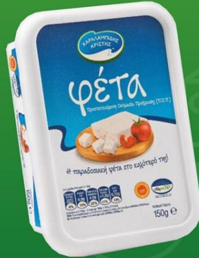
Charalambides Christis Feta In Brine Available sizes: 150g

Feta is a brined curd white cheese made in Greece from sheep's milk or from a mixture of sheep and goat's milk. Similar brined white cheeses are often made partly or wholly of cow's milk, and they are sometimes also called feta.