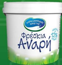
Fresh Anari in pouch Available size: 400g