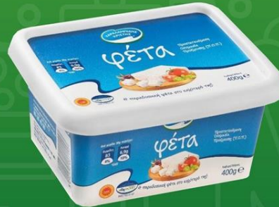
Charalambides Christis Feta In Brine Available sizes: 400g