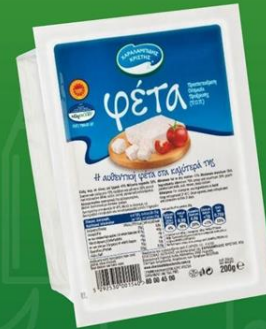
Charalambides Christis Feta Available sizes: 200g