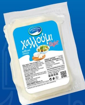
Low-fat Halloumi Sold according to weight in individual packaging