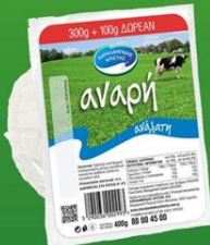
Fresh Anari Unsalted Available sizes: 300g, 900g

Cypriot anari is a soft cheese, with a low-fat content that is rich in proteins and calcium. It is recommended by nutritionists for those on a low-fat diet.