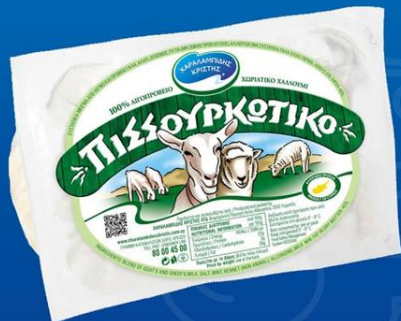
Pissourkotiko Traditional Halloumi Sold according to weight in individual packaging

Halloumi is a predominantly Cypriot cheese product. It is a semi-hard cheese which is produced with a mix of cow's and sheep's milk or with the traditional sheep's milk and it can be a delicious choice for every meal.