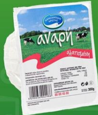
Fresh Anari Salted Available sizes: 300g, 900g