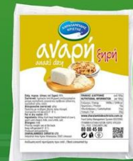
Dry Anari Sold according to weight in individual packaging