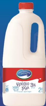
Fresh, full-fat milk with 3% fat content Available in 3 different sizes 1L, 1.5L and 2L

Pure, fresh cow's milk which is collected everyday from Cypriot farms. It is pasteurised, homogenised and bottled in our modern factory in strict hygiene and safety conditions with ongoing quality controls that do not affect the milk's nutritional ingredients, as stipulated by the Quality Management System enforced by the company.