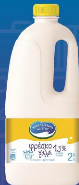
Fresh milk with low-fat content Available in 3 different sizes 1L, 1.5L and 2L