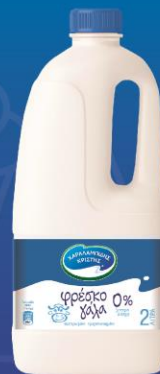
Fresh, non-fat, skimmed milk Available in 1 size 1L