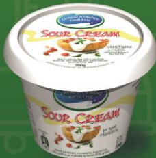
Sour Cream Available size: 200g