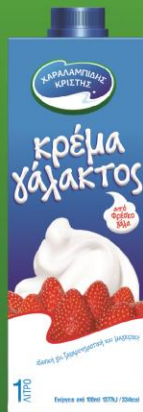
Dairy Cream with 35% fat Size: 1 Litre

Dairy cream with 35% fat has no added preservatives, preserved only by UHT processing. A Light version is also available with 17% fat. Its rich taste makes it ideal for both confectionary and cooking.