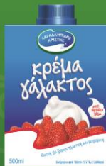
Dairy Cream with 35% fat Size: 500ml